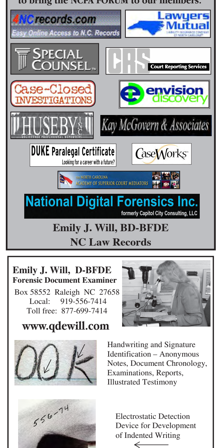
Video Spectral Comparator to reveal multiple inks, obliterations and alterations to documents

Your generous support helps make it possible to bring the NCPA FORUM to our members.